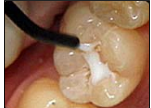
Placing white sealant

To place sealants, we usually don't even have to numb your mouth. First we thoroughly clean and dry the teeth. A conditioning solution is applied, and then the sealant material is brushed into the grooves. Some kinds of sealants harden on their own, while others harden when exposed to a special light. Sealants occasionally have to be replaced, because they do wear out. Chewing on anything that is hard, including ice, makes them wear out even faster.