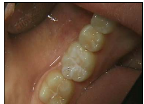
Sealant hardens quickly

Sealants are an important part of an effective preventive dental care program.